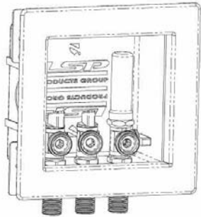
Angle Stop and Dishwasher W/ H.A.